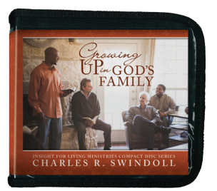
Growing Up in God's Family by Charles R. Swindoll CD series