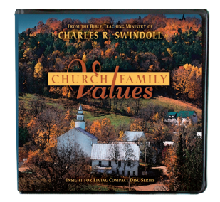
Church Family Values by Charles R. Swindoll CD series