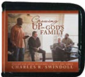
Growing Up in God's Family by Charles R. Swindoll CD series