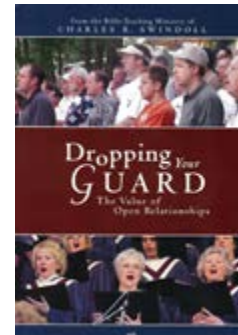
Dropping Your Guard: The Value of Open Relationships by Charles R. Swindoll softcover book

For these and related resources, visit www.insightworld.org/store or call USA 1-800-772-8888 • AUSTRALIA +61 3 9762 6613 • CANADA 1-800-663-7639 • UK +44 1306 640156