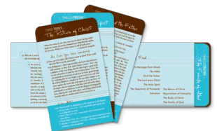
Essential Truths: A Pocket Guide for Growing Deep by Insight for Living card set

To order any of these recommended resources, call 1-800-663-7639