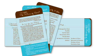
Essential Truths: A Pocket Guide for Growing Deep by Insight for Living card set

To order any of these recommended resources, call 1-800-663-7639