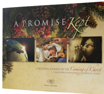
A Promise Kept: A Pictorial Journey of the Coming of Christ by Insight for Living Ministries softcover book