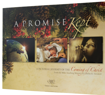
A Promise Kept: A Pictorial Journey of the Coming of Christ by Insight for Living Ministries softcover book