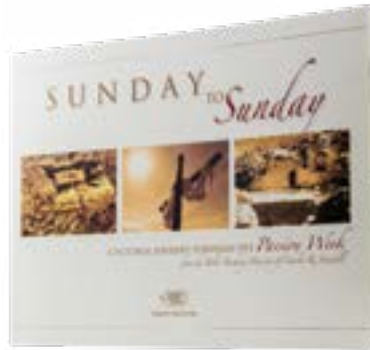
Sunday to Sunday: A Pictorial Journey Through the Passion Week by Charles R. Swindoll Softcover book