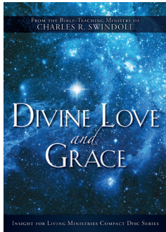
Divine Love and Grace by Charles R. Swindoll CD series