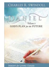
Daniel, Volume 2: God's Plan for the Future Bible Companion by Insight for Living softcover book