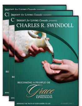
Becoming a People of Grace: An Exposition of Ephesians by Charles R. Swindoll CD series

Balancing Grace with Love by Charles R. Swindoll CD series