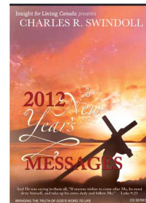
2012 New Year's Messages by Charles R. Swindoll CD series