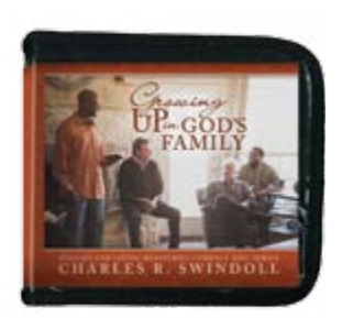
Growing Up in God's Family by Charles R. Swindoll CD series