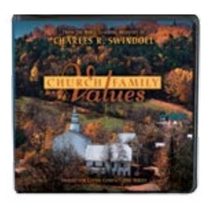
Church Family Values by Charles R. Swindoll CD series