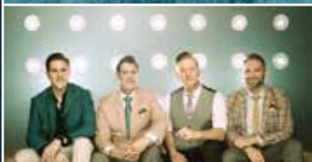
ERNIE HAASE & SIGNATURE SOUND Musicians